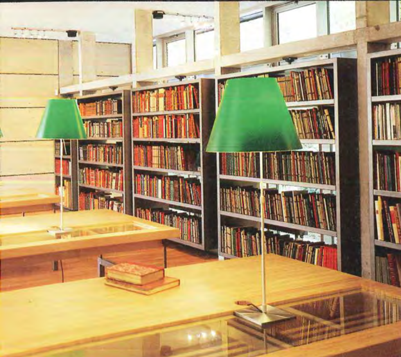
F. De Cugnac